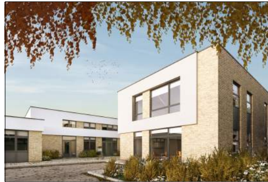
3D View of Junior School Proposed Extension (Scola Reclad beyond)