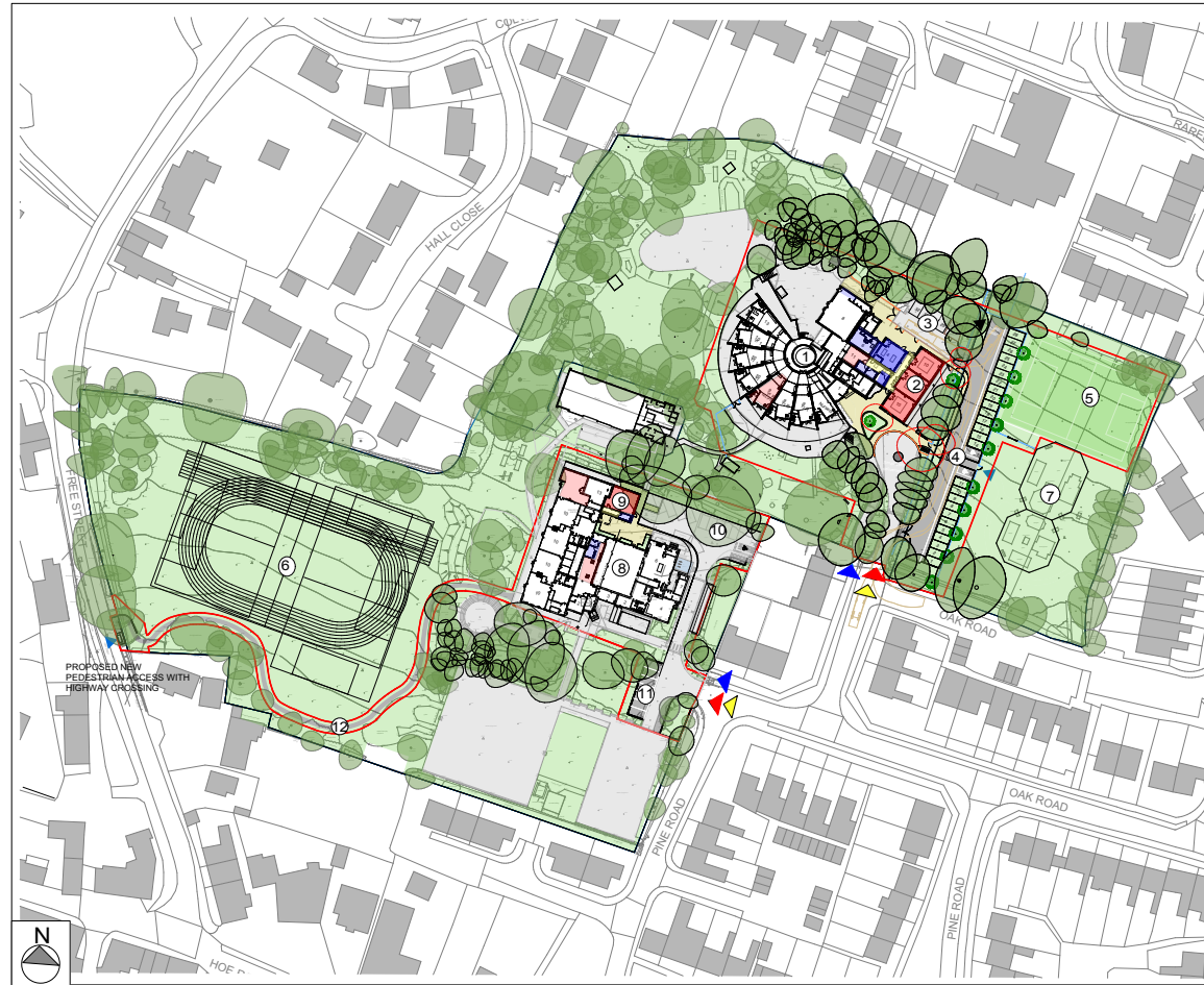
Proposed Site Plan; Infants School (North) and Junior School (South)