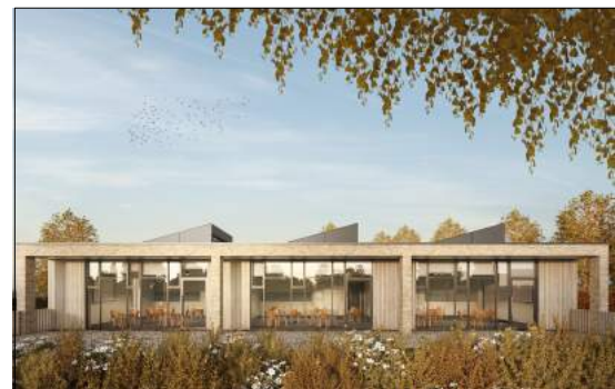
3D View of Infants School Proposed Extension